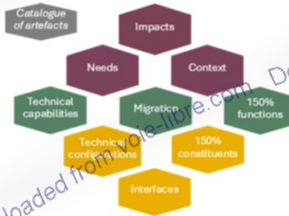
Fig. 1. Description of the views developed in FP2-R2DATO architecture file

This section synthesizes the initial results of activities that began in 2024 by applying retrospectively the systemic exploration using different points of view provided in FP2-R2DATO architecture file, as illustrated in Figure 1: